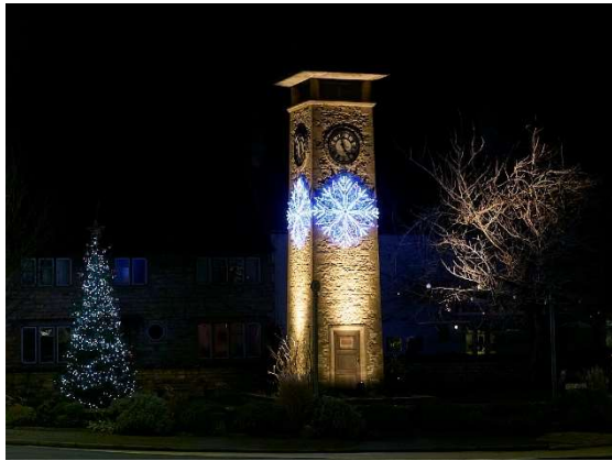
Mortimer Garden before: