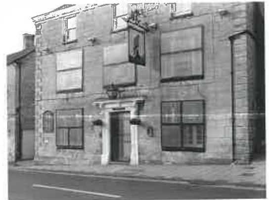
The Falcon boarded up in 1995 A view we hoped never to see again

The Falcon is a substantial business, with 11 bedrooms as well as the pub / restaurant side. It has been a significant employer in Painswick as well as an important social centre, and has been providing accommodation for visitors and refreshment for locals for probably well over 400 years, since Tudor times, although it was out of use and boarded up for a period in 1995.