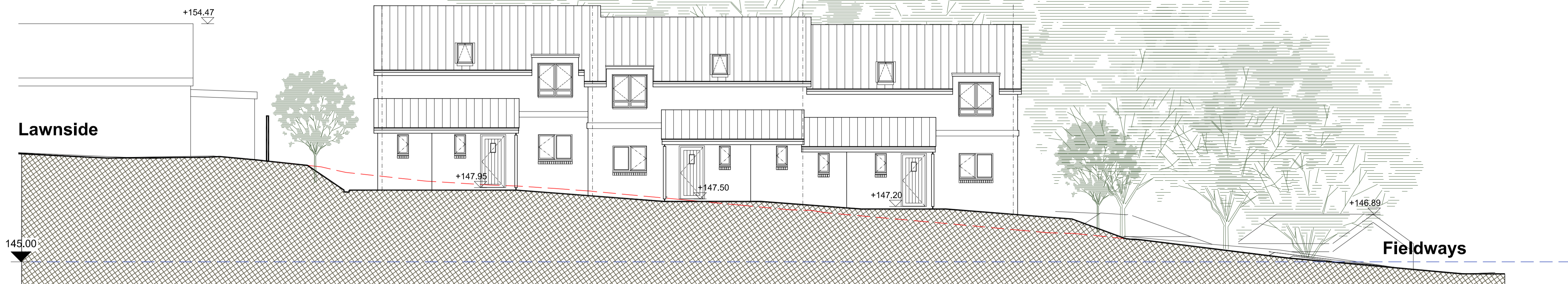
Block Section / Elevation A-A

This drawing is copyright and may not be reproduced without the permission of gcp Chartered Architects Ltd. All drawings to be read in conjunction with the project specification with all works carried out in accordance with the latest British Standards and Codes of practice. Except for the purposes of assessing planning applications, this drawing is not to be scaled. Use figured dimensions only. All dimensions are to be checked on site and any discrepancies between this drawing and other information given elsewhere must be reported to gcp Chartered Architects before work proceeds.