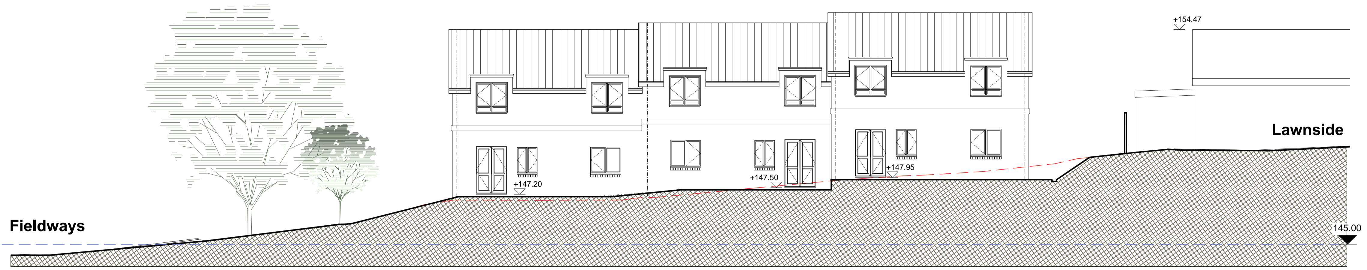
Block Section / Elevation C-C

This drawing is copyright and may not be reproduced without the permission of gcp Chartered Architects Ltd. All drawings to be read in conjunction with the project specification with all works carried out in accordance with the latest British Standards and Codes of practice. Except for the purposes of assessing planning applications, this drawing is not to be scaled. Use figured dimensions only. All dimensions are to be checked on site and any discrepancies between this drawing and other information given elsewhere must be reported to gcp Chartered Architects before work proceeds.