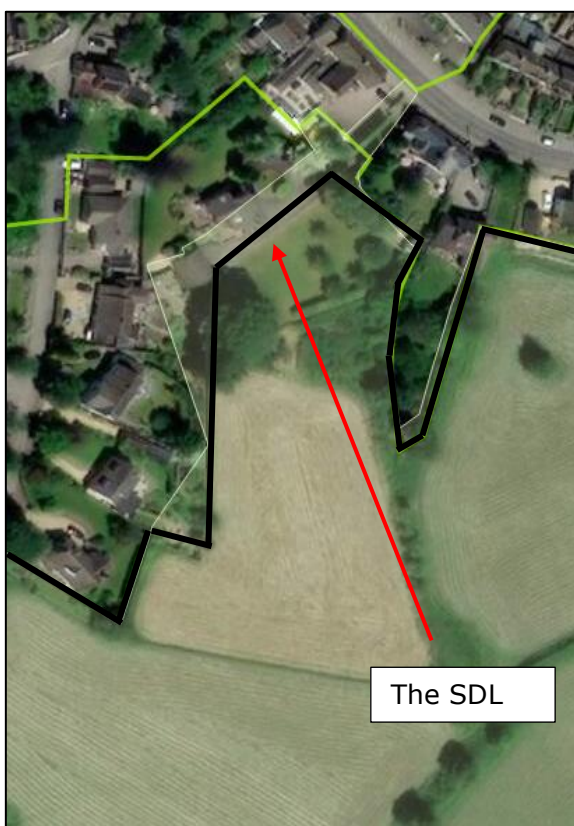
Policy Map for Stroud Local Plan

As shown on the below policy map for the Stroud Local Plan (the Black Line - SDL) the SDL cuts through the garden and rear of this property, the intention of this representation is to move the boundary in line with the boundary of the property, so that it is consistent with the applicants private land ownership shown below in red with the yellow dotted line indicates the altered SDL. The proposed amendments would also ensure the SDL align with features on the ground.