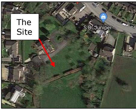
Aerial Photograph of the Site

The Site is located to the South of Dursley and is situated to the edge of the settlement of Dursley. Dursley is a very large settlement and is one of the District's historic market towns. The Site is residential and garden land and is at the urban edge of the settlement, the Site is mostly within the current Dursley Settlement Development Limit.