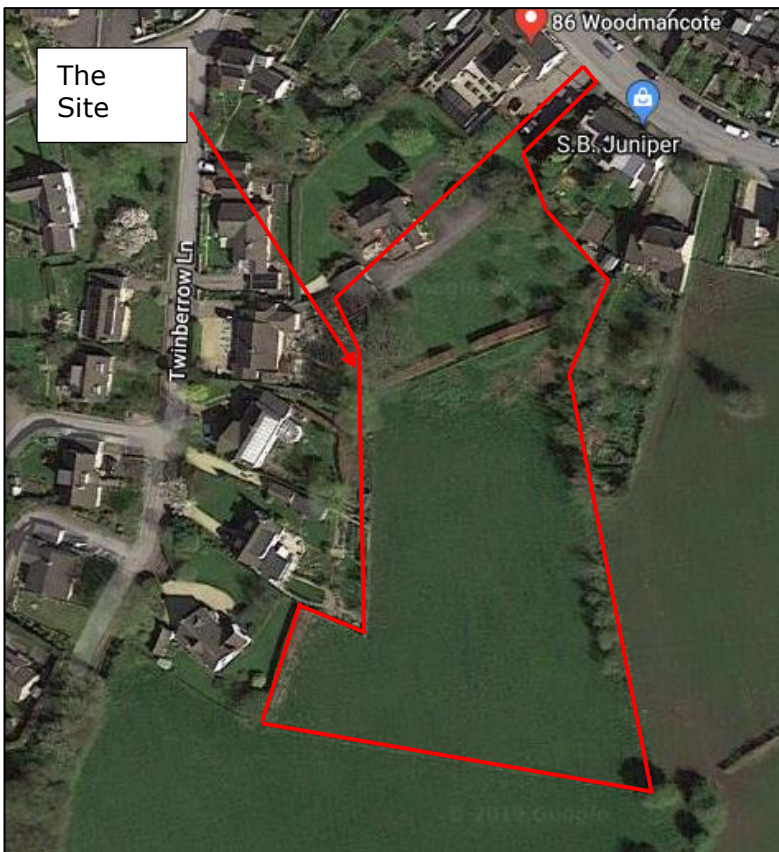
Aerial Photograph of the Site