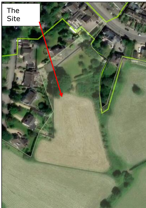
Policy Map for Stroud Local Plan

Dursley is a very large settlement and is one of the District's historic market towns. Dursley has a strong 'strategic' retail role as one of the District's five town centres. It offers a very good level of local community services and facilities (GP, dentist and pharmacy, post office, primary schools and pre-schools, places of worship, pubs, town hall/community centre, sports/playing fields and playgrounds) and has an important role in providing a diverse range of 'strategic' services and facilities to a wider catchment (hospital, banks, secondary school and 6th form, library, swimming pool and leisure centre). Dursley has along with Cam) the best access to key services and facilities of anywhere in the District. The town has an important employment role and also functions as a 'dormitory' settlement and strategic service centre.