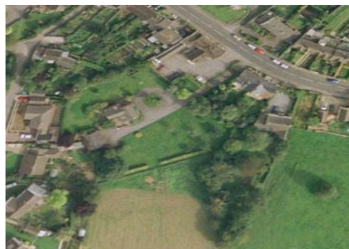
Aerial Photograph of the Site from 1999

The Site is partially located within the Cotswold Area of Natural Beauty (AONB), the boundary of which doesn't follow any particular feature on the ground. The Site is surrounded by residential development on its western, northern and eastern edge. In this respect the surrounding character and a large portion of the property are residential in nature and within the development limit of the settlement at this location. The Site is in keeping with neighbouring uses and the wider settlement.