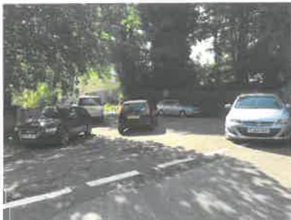
Photo 10: Bend Z - point of proposed access to Washwell Fields site

The photographs provided in support of these arguments were taken randomly mainly during the summer months. The situation is exacerbated in the winter when darkness and gloomy weather further reduce visibility and road conditions become slippery.