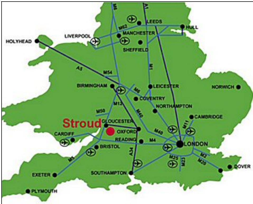
Figure 2: Map of Stroud District Council